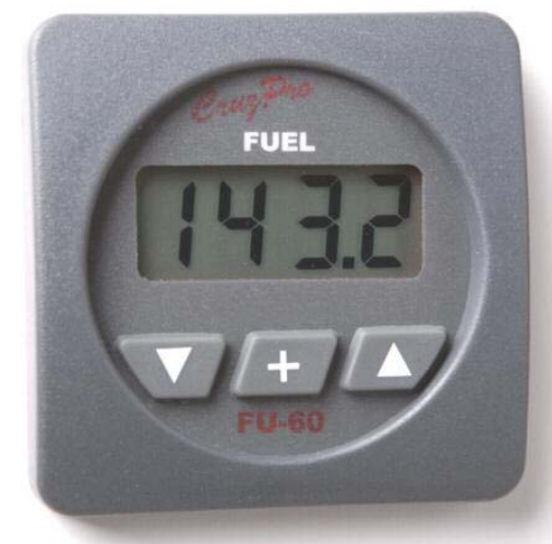
Intelligent Digital Fuel Gauge/w Alarms & Consumption Calculator

key again results in the next set of data being displayed.